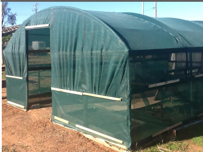
Revamped Green House completed by Year 9/10 Agriculture.