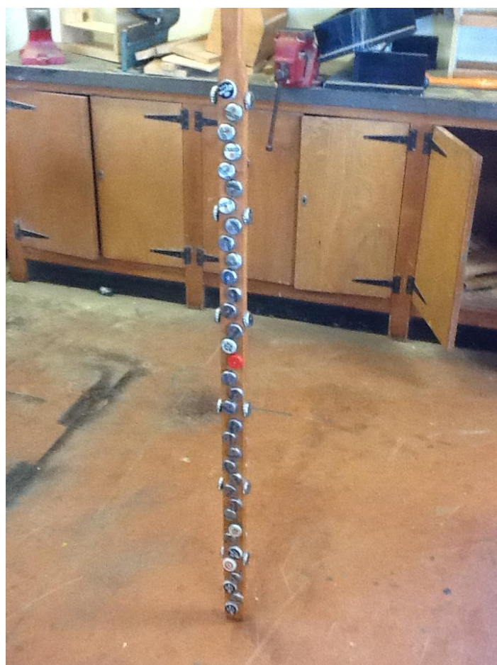
Larger Phone made by Year 8.