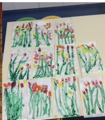
We have colourful art in our classroom.