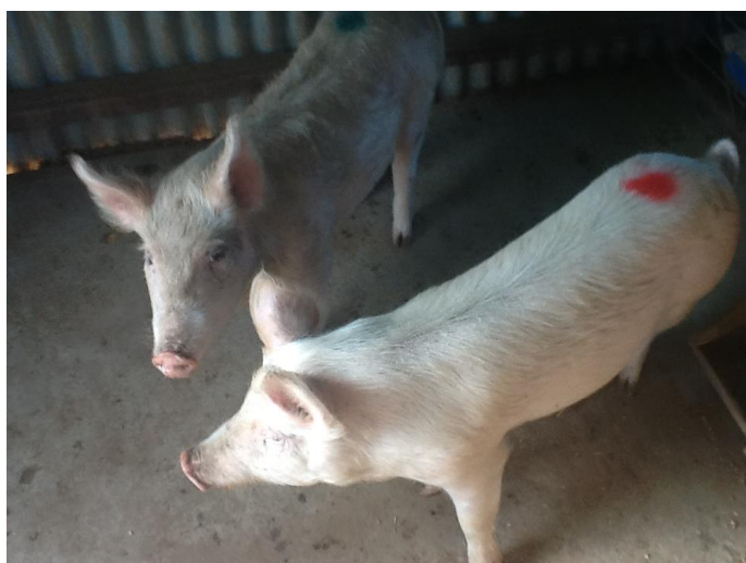
Our school's new pigs Val and Terri.