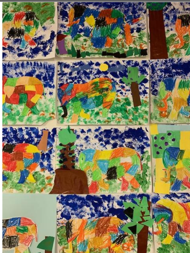
We love using colour in our Art.