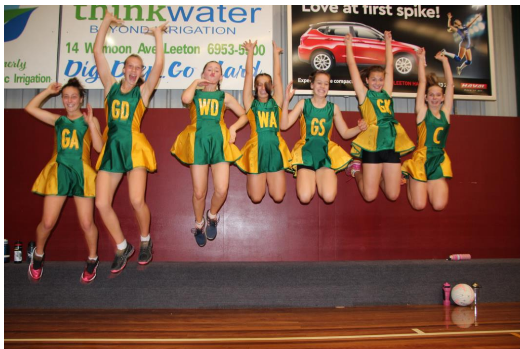
Our netball team were undefeated at Leeton and will now compete at Dubbo.

Some of our students have currently been revising their progress on the learning goals they have set to see how they are progressing this year. Some students feel they have achieved their goals and have created new goals while others are still focusing on their goals from the beginning of the year. Spend some time talking to your child about what their learning goals are and how they feel they are working towards these.