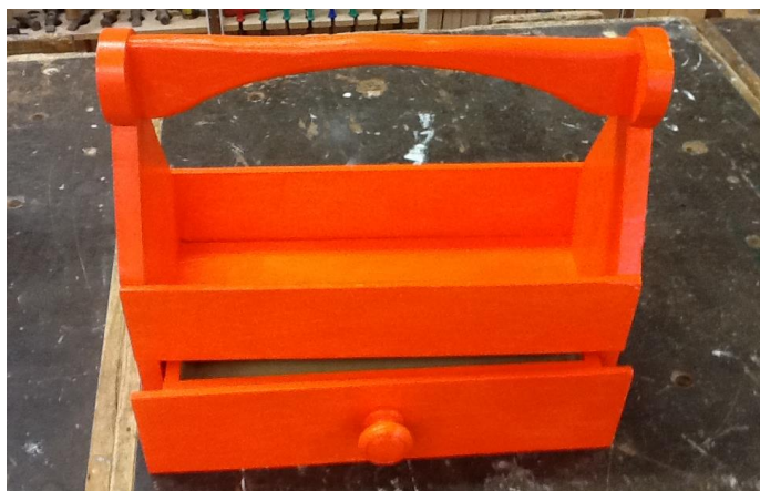
Tool box made by Year 9/10 Wood.