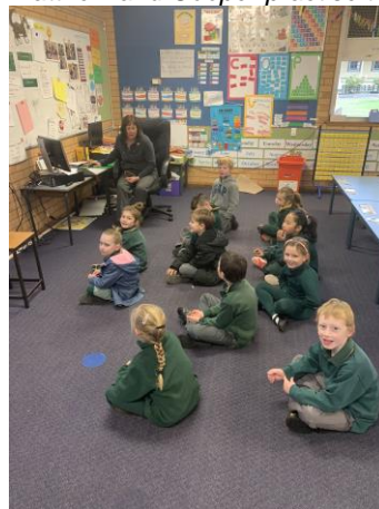
Foundation/Year 1 learn their sounds every morning.