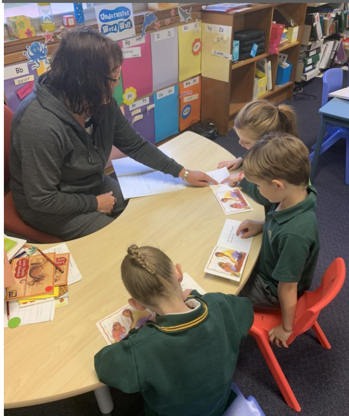
Reading together helps build our confidence