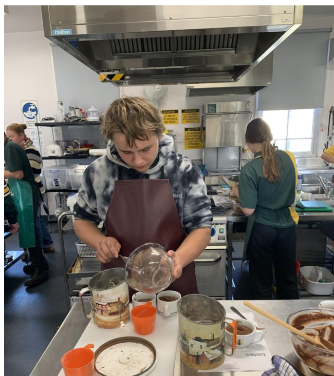
The Trade Trading Centre is a hive of activity during Food Technology classes.

The Year 7 and Year 8 TAS classes have swapped teachers. The Year 8 are now doing a unit on Cultural Foods. We have successfully completed a Green Thai Chicken Curry, Scottish Shortbread and a Lemon Tea Cake. Their assignment work is to select a culture from anywhere in the world and explain the importance of food to that culture. They will soon be preparing to make a dish from their selected culture.