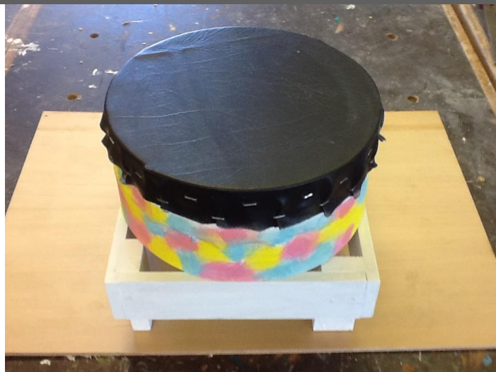
Drum made by Year 8.