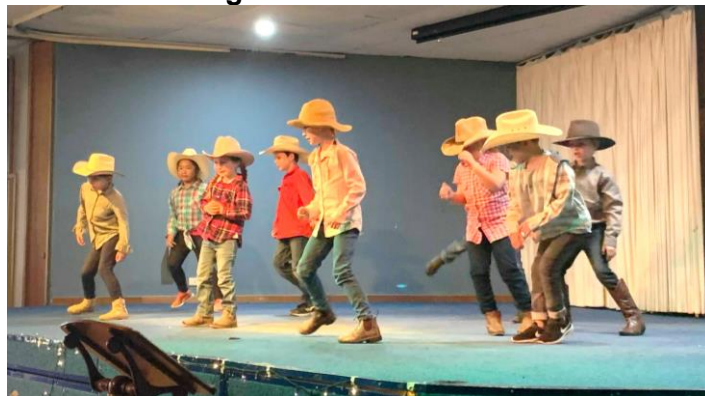
Foundation-Year One performing 'The Git Up'