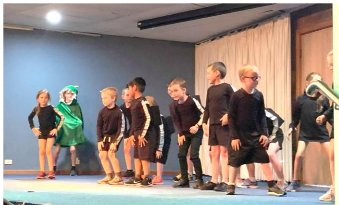
Year 1-2 Ghost Busting.