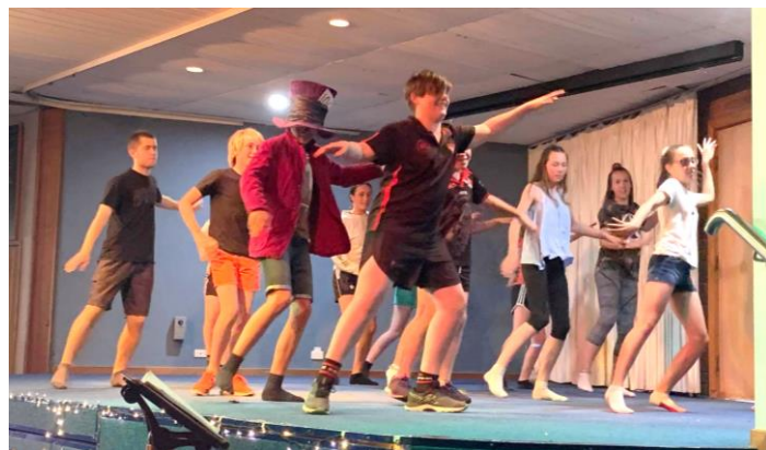
Year 7-8 Time Warp