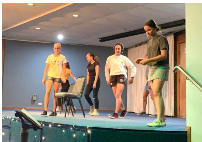
Fairfax Drama Group.