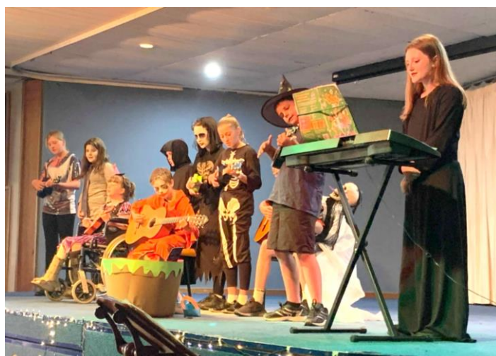
Year 5-6 Adams Family