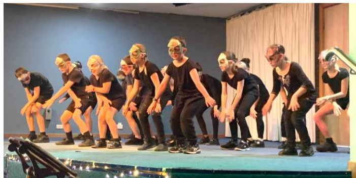
Year 3-4 Cha Cha Slide