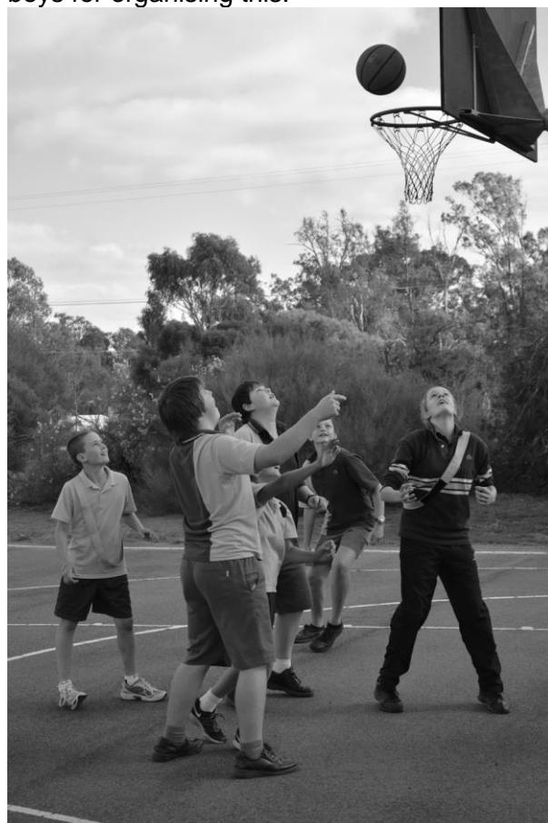
Students were all keeping their eye on the ball during Lunchtime Sport.

This week our SRC started Lunch Time Sports from Years 6-11 during Thursday lunch time. This was a great success with students enjoying competing against each other. Thank you to our secondary SRC boys for organising this.