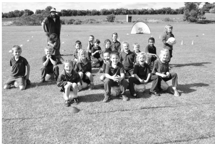
Year 1/2 eager to start the Soccer Clinic