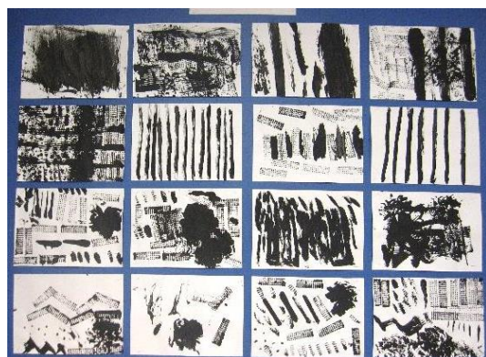
Art – exploring lines relate to the story “Where the Wild Things Are”