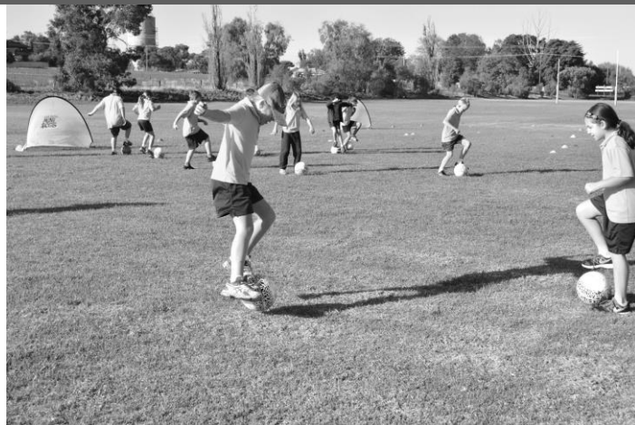
Year 3/4 all enjoying the Soccer Clinic.