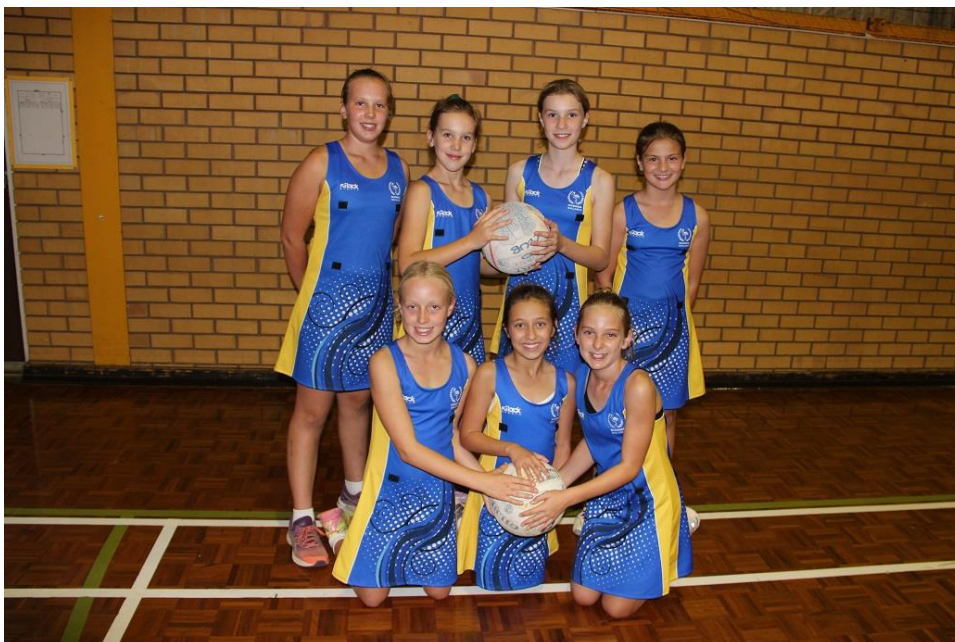
PSSA Netball team ready to compete at Griffith.

Teachers are also focusing on feeding forward, when giving feedback praising what has been done but then giving a suggestion of what to do next to keep improving, eg I like the way you sounded that word out, try that strategy when sounding this word out as well.