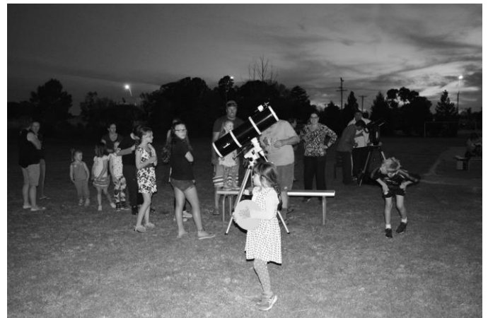
Lining up for a turn to look through the telescope.