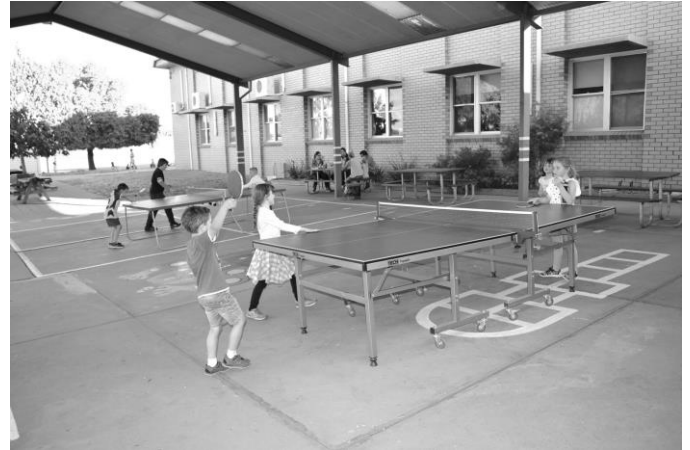
Table tennis kept people occupied while waiting for the stars.