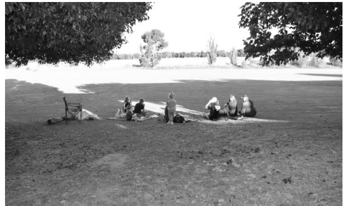
Families dined on pizza and sausages on the