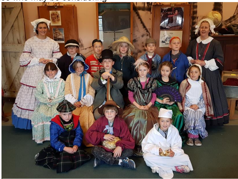
Year 3 / 4 had a wonderful time on their excursion to Sovereign Hill.

This Monday is a 'Blue' casual dress day to raise money to support men's cancers.