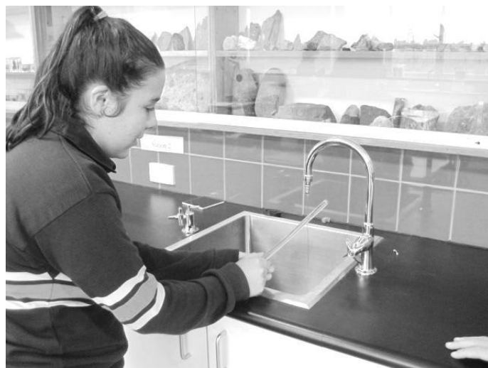
Phoebe attempting to bend the flow of water.

The students recently examined the properties of static electricity and can be seen here attempting to bend the flow of water.