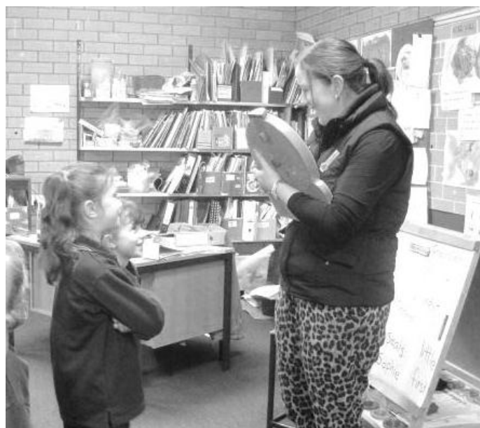
Foundation in a time telling race