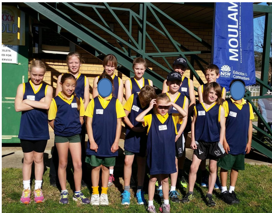
Tooleybuc Students competed at the Riverina Cross Country in Gundagai.

They then shift into the next stage which is the 'Challenge'. This is where the learner actually has to do something or engage with the new concepts that they are unfamiliar with, and this is a challenge, it is something that we have to learn. The learner often finds this part hard, they start to