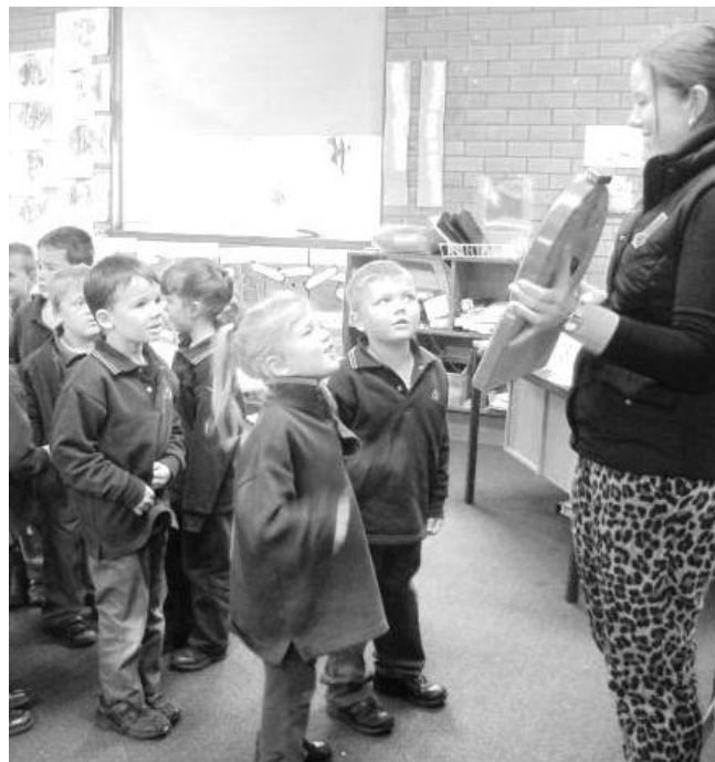
Foundation in a time telling race

As you can see Foundation students enjoy many different aspects of the curriculum and see themselves as successful learners and are willing to embrace challenging skills.