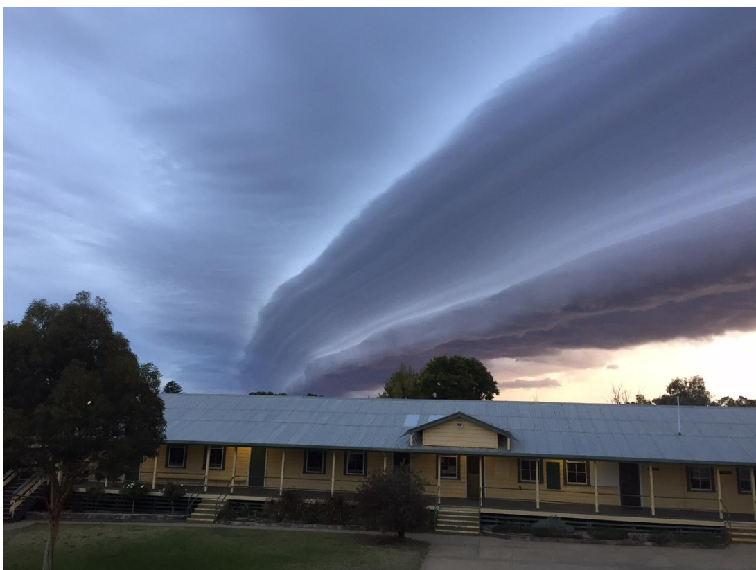
Spectacular clouds over Tooleybuc School at 7:30 am

This has serious implications for the way that we all talk to our students. The old adage that 'You're not good at Maths, just like me' gives our children a fixed mindset and encourages them to give up, rather to persist and try and develop their learning. We need to make sure that when we praise students, we praise the effort or the process not their intelligence. We need to encourage students to 'have a go' and to learn from their mistakes rather than see them as failures.