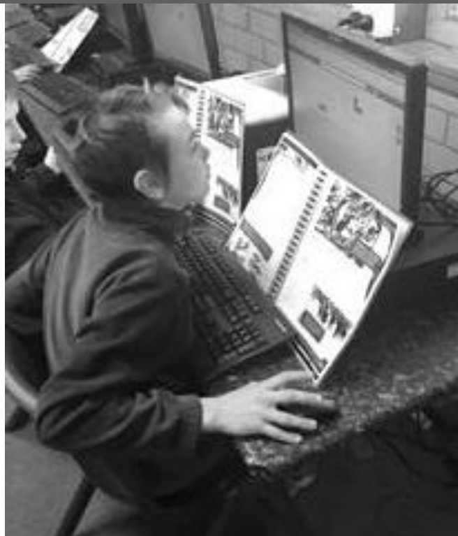
Campbell completing a learning task on Edmodo