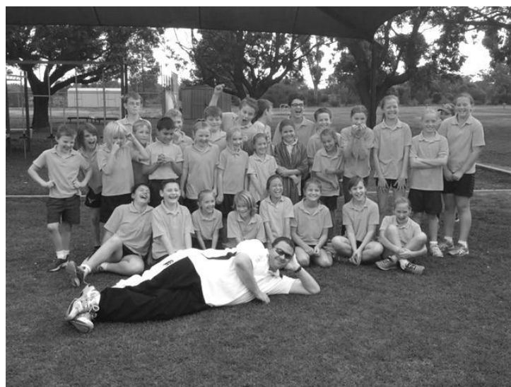
Competitors at the PSSA Moulamein Cross Country