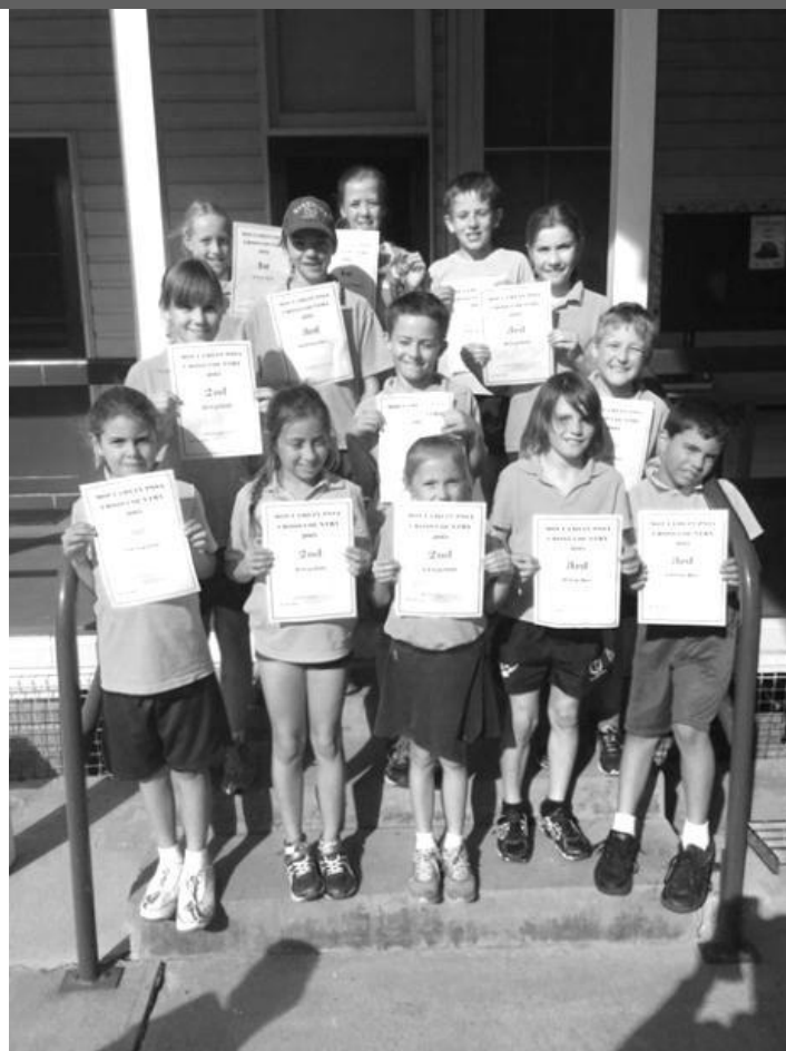
Place getters at the PSSA Moulamein Cross Country