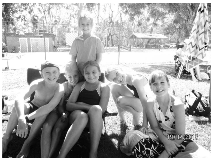
Resting between heats can be fun during the Twilight Swimming Carnival.