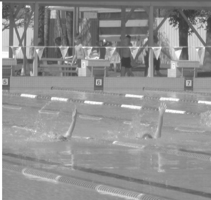
You could almost think we had synchronised swimming as these two students competed at the Twilight Swimming Carnival.