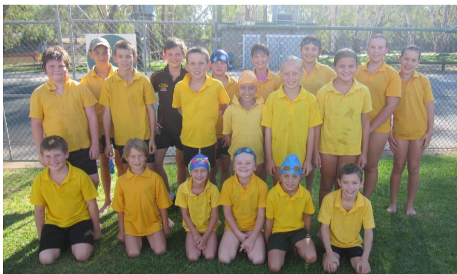
Our students were proud of their achievements at the PSSA Zone Swimming Carnival