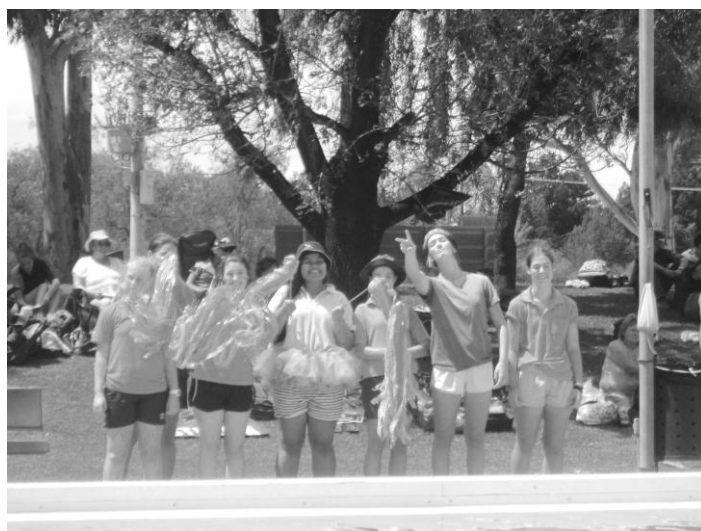
Students cheered from the side during the races.