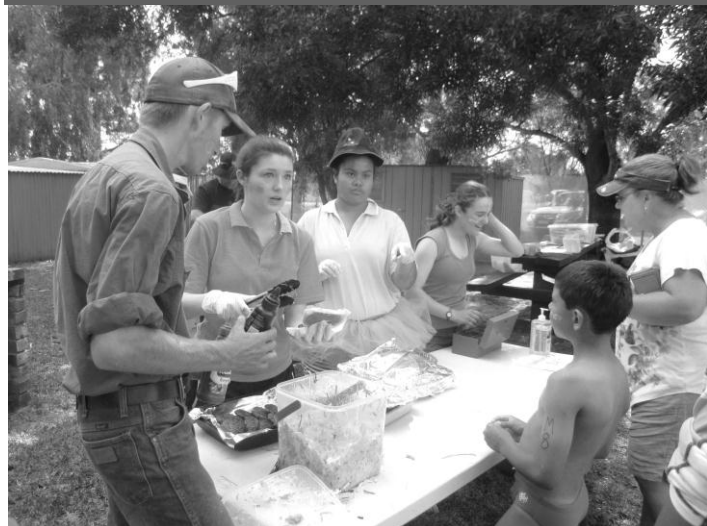
The barbecue was enjoyed by many.