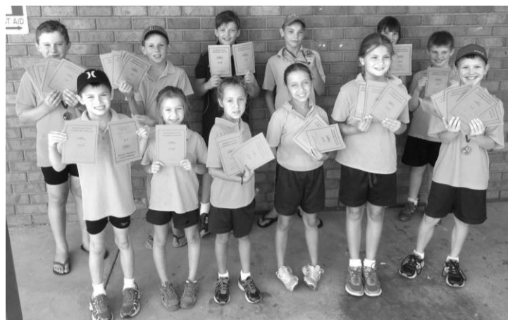
Students that received a place at the Moulamein PSSA Swimming.