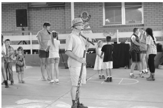
Children and adults all joined in learning the dances.