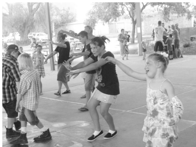
Zombie style was part of the activities