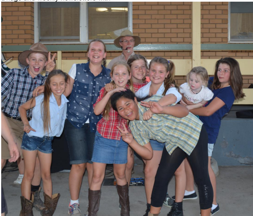
Billy Tea Bush Dance, gets the students tapping to the music.