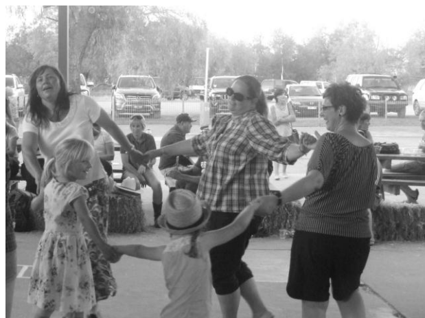
Students, Parents and Teachers all enjoyed the Billy Tea Bush dance.

Please name your uniforms so we can return items that are misplaced.