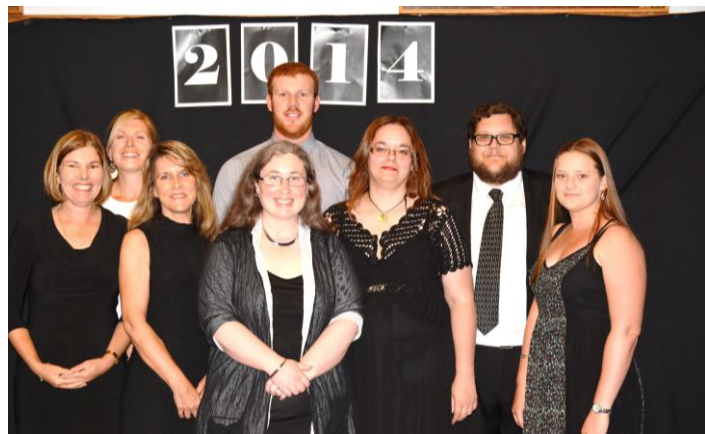
Staff at the Year 12 Farewell/Formal