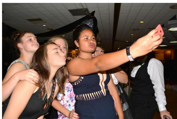
Selfies at the Formal