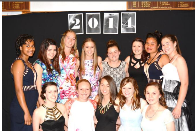
Delightful young ladies at the Year 12 Farewell/Formal