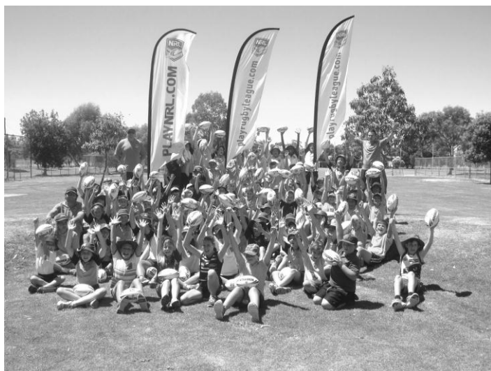
All the students had a wonderful time and each received their own rugby ball

The students in Years 3 to 6 were given the opportunity to attend a skill development day in Balranald last Thursday. The students that attended had a fantastic time and learnt a lot about Rugby League.