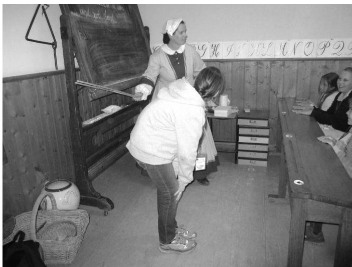
Olden days discipline was demonstrated at Sovereign Hill