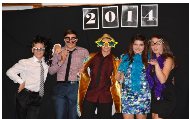
Having fun at the Year 12 Farewell/Formal