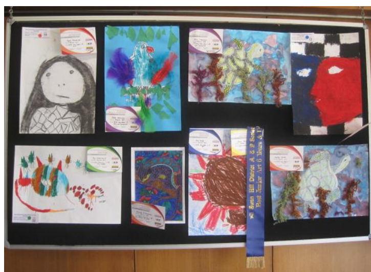
Students excelled at the Swan Hill Show, the award winners are on display in the front office