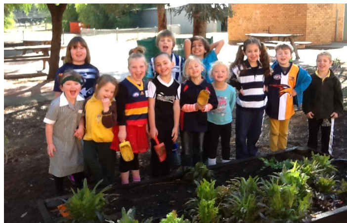
It was a colourful group as Foundation/Year One tended their veggie patch during Footy Colours Day