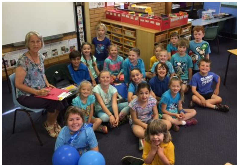
Year 1 / 2 wore blue for Men's Cancer

Our current Year 12 students are undertaking their HSC exams and will finish in the near future. To celebrate their time at Tooleybuc Central School, we will be holding a Year 12 Farewell Dinner for these students and their parents next week.