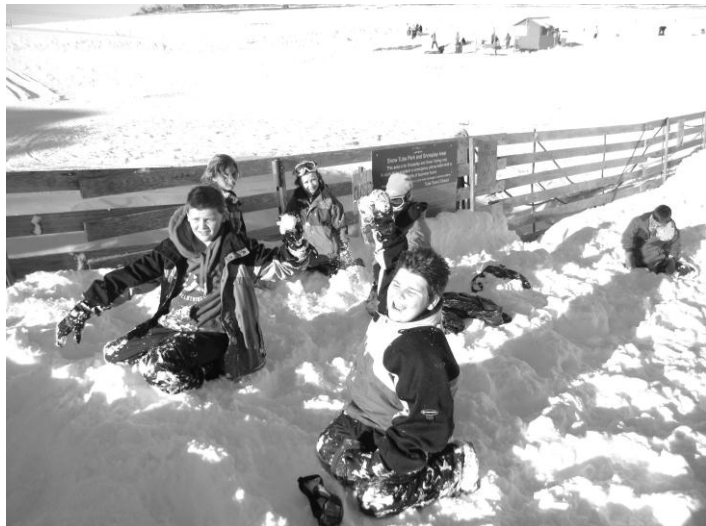
Year 5/6 enjoying the snow