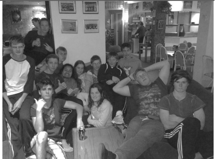
Tooleybuc and Barham students relax after a day of skiing and snowboarding.