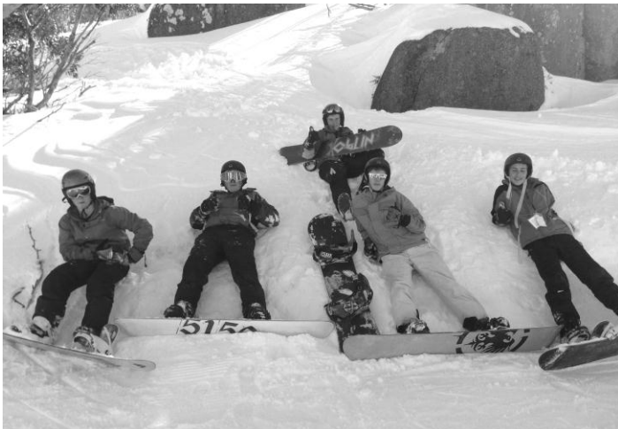
Year 9/10 waiting to use the snowboards

Last week 15 Year 9/10 PASS students were lucky enough to attend the Tooleybuc and Barham School Snow Trip. This trip gave the students the opportunity to explore a new area of Australia while giving them the chance to see snow for the first time. The students enjoyed a snowboarding or skiing lesson every morning with qualified instructors and then free time in the afternoon to perfect the skills developed in their lessons. This saw students picking up new skills very quickly, with everyone successfully skiing and snowboarding by the end of the first day. There were many spills and thrills which were all part of the fun. I was told on multiple occasions just how polite and nice the Tooleybuc students were by a variety of people that had contact with the students. This made the trip a pleasure for myself to attend, so thank you to all the students who attended. A huge thank you to the parents and carers that were available for transport to and from Barham High School both early morning and late evening.