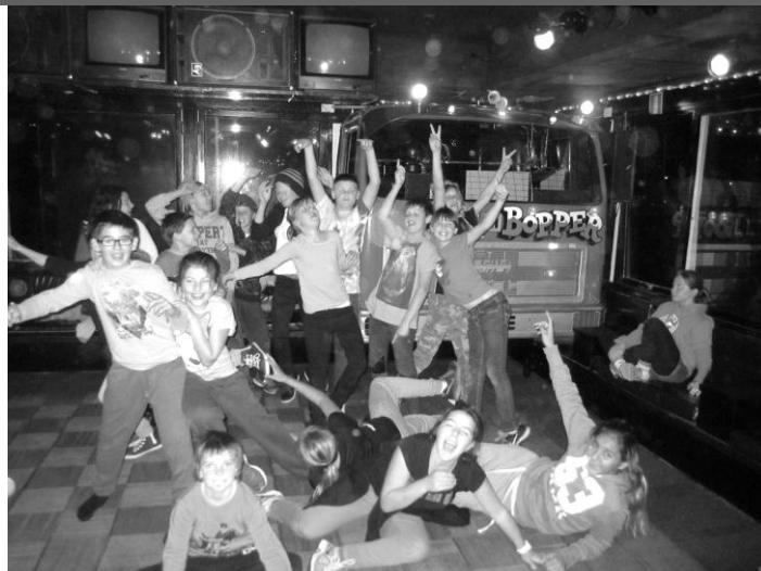
Year 5/6 bopping at the Disco