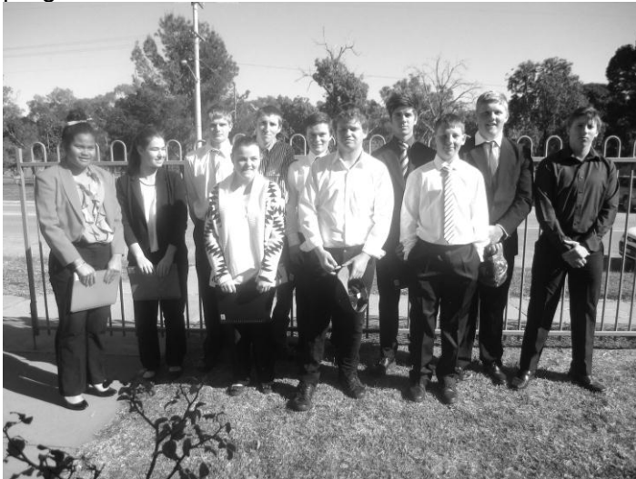
Year 10 students all dressed ready for their interviews.