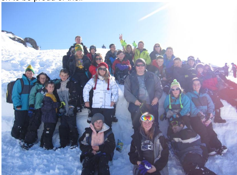
Year 5/6 enjoy the snow on their way to visit Canberra.