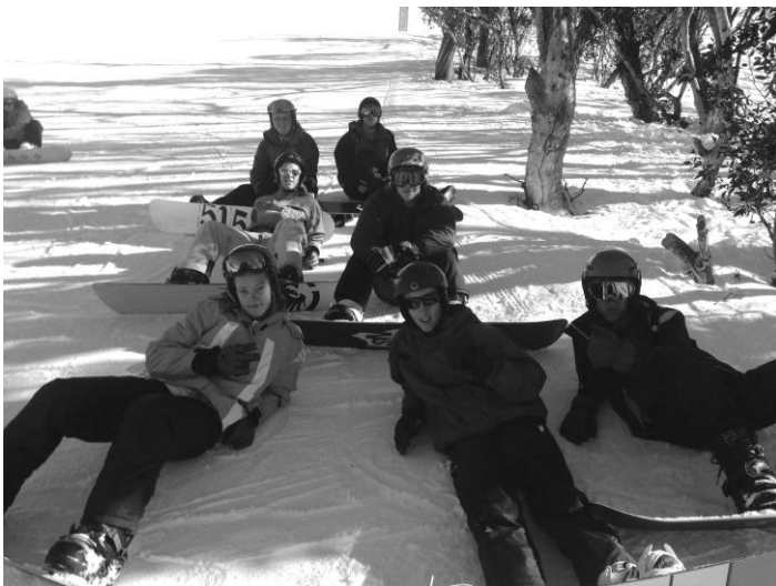
Year 9/10 waiting to use the snowboards