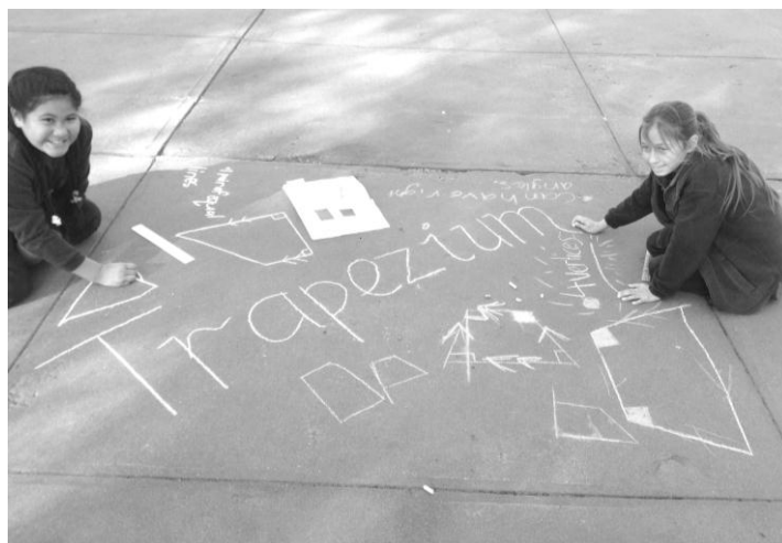
"We learned that a trapezium can be drawn differently and sometimes they have right angles" By Hiva and Tara.