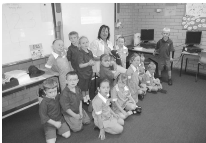
Kindergarten class are ready to start learning.

All clothing and equipment needs to be clearly labelled including lunch boxes and drink bottles.