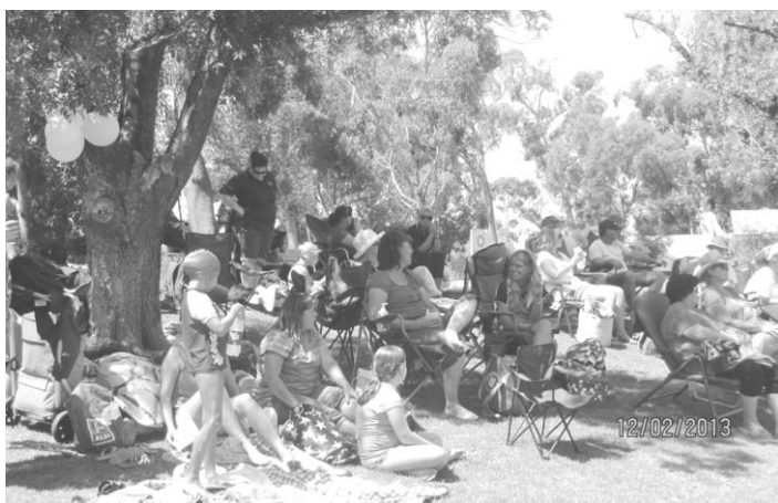
The Swimming Carnival was enjoyed by all.