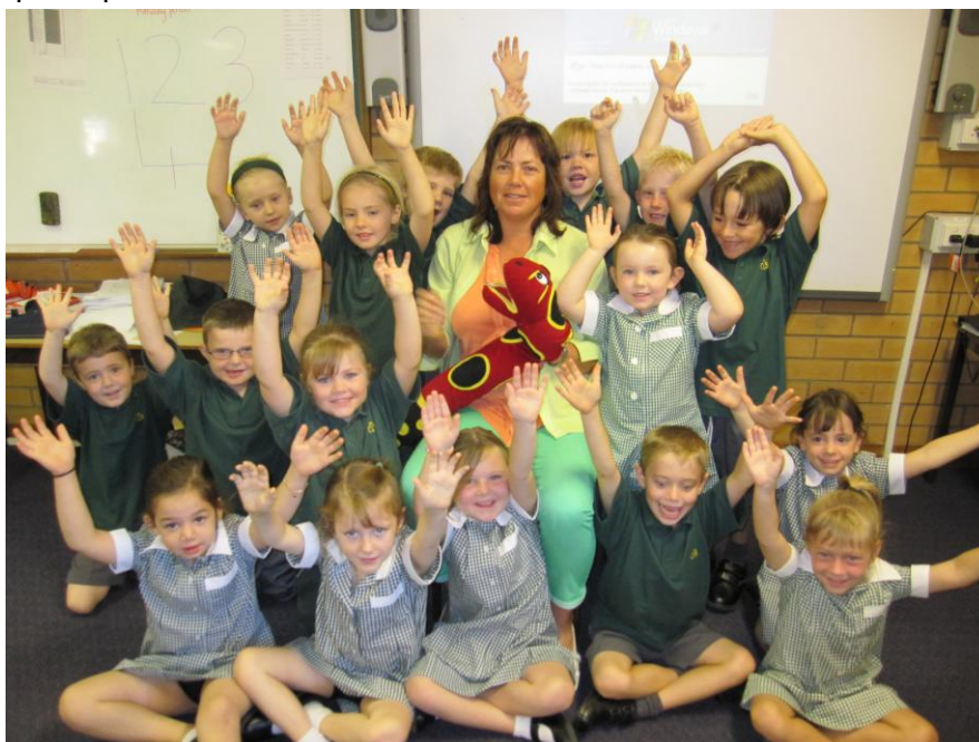
Our Kindergarten students have settled in easily to our school.

Next Wednesday we are holding our school photos. Don't forget to return your order forms. Students should wear their full school summer uniform, including black leather shoes.