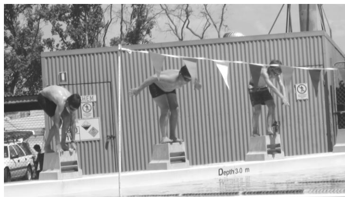
Primary boys get set to start their swimming race.