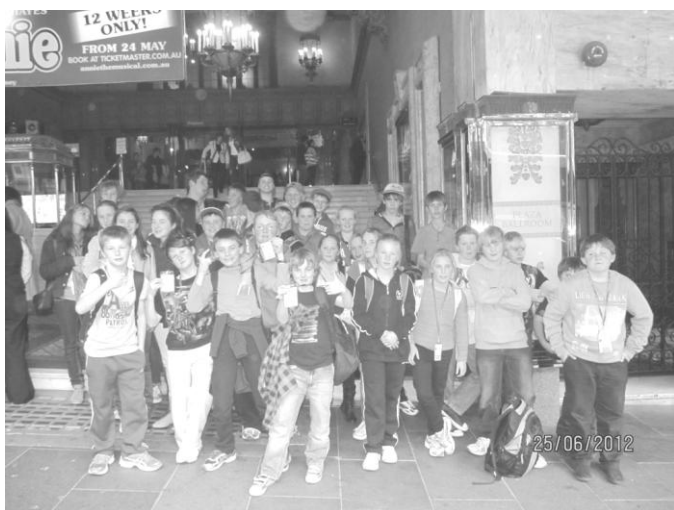
Students all enjoyed the performance of Annie