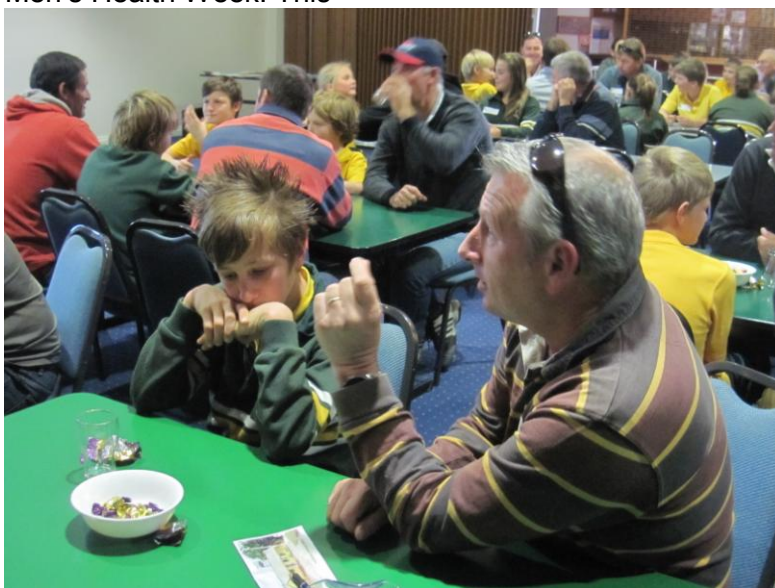
An enjoyable day was shared with students and male role models at the recent "Men's Health, Special Person Day".

Web: www.tooleybuc-c.schools.nsw.edu.au/