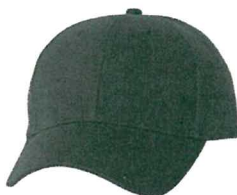
Hat Sample (will have gold school logo on front & 100 Years of Education on the back)